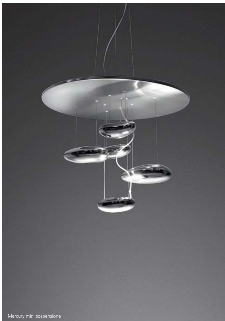
Mercury mini sospensione