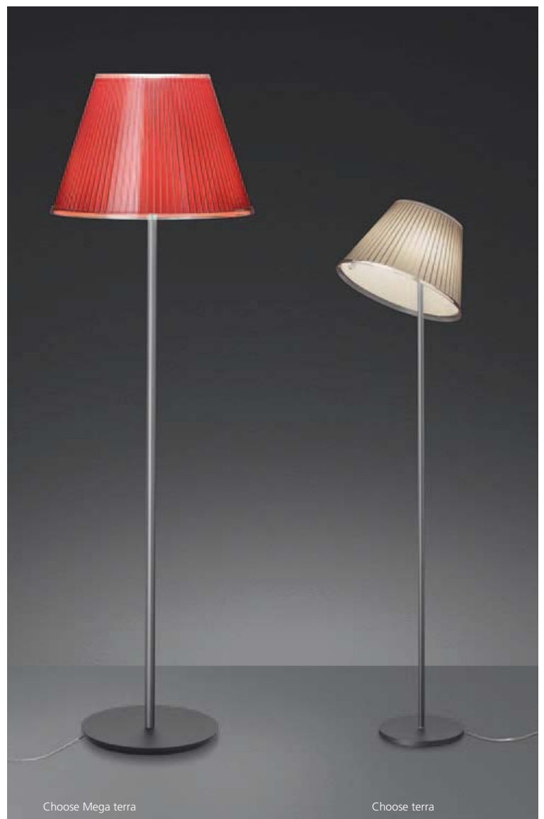
Choose Mega terra